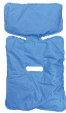
Junior Vacuum Mattress